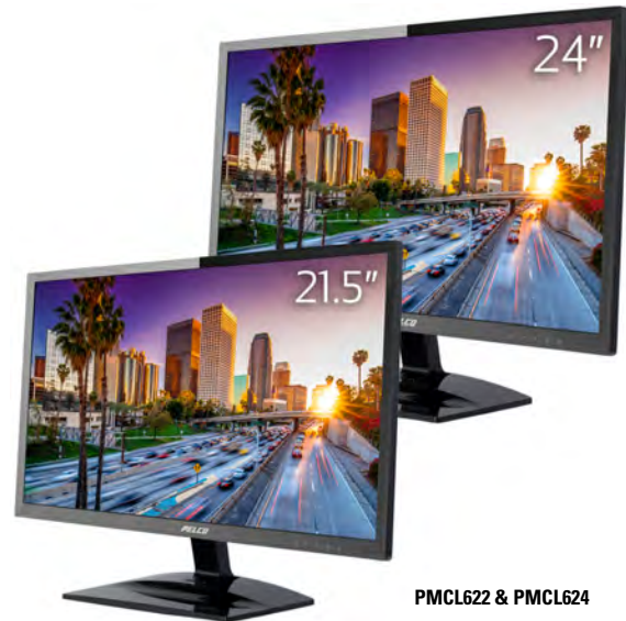
PMCL622 & PMCL624

Pelco's PMCL600 Series monitors combine the latest technologies into a perfect complement to your investment in megapixel imaging and performance. Desktop full high-definition (FHD) monitors deliver 1920 x 1080 resolution and are specifically engineered to exceed the demands of surveillance operators.