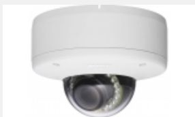
SNC-DH180 Outdoor IR Ruggedized 720p/30 fps Camera - V Series