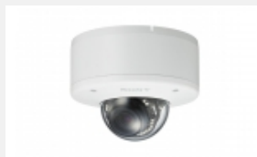
SNC-EM602RC Outdoor IR ruggedized 720p/30 fps camera powered by IPELA ENGINE EX™