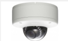
SNC-DH280 Outdoor IR Ruggedized 1080p/30 fps Camera - V Series