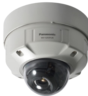
with Base Bracket