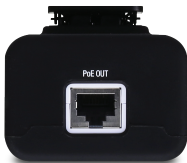
PoE Out Port

Rubber Case Clip Use the clip on the back of the rubber casing to secure the U-Installer to a belt or pocket.