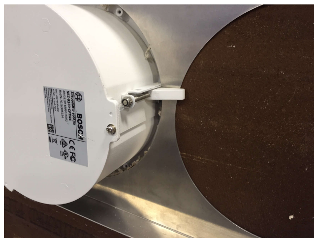
Example installation: in-ceiling AUTODOME IP 5000 HD camera clamped to MNT-ICP-ADC on top of ceiling tile