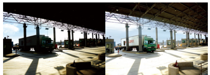
Without WDR Pro