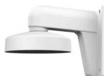
Wall mount DS-1272ZJ-110