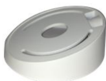
Inclined ceiling mount DS-1259ZJ