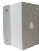
LTB379 Corner Mount