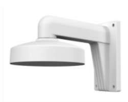
LTB342-110T Wall Mount