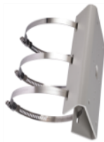
LTB378 Vertical Pole Mount