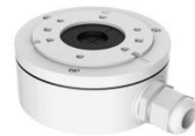
LTB345 Junction Box