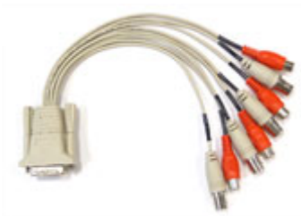
4 cam video cable