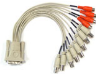
8 cam video cable