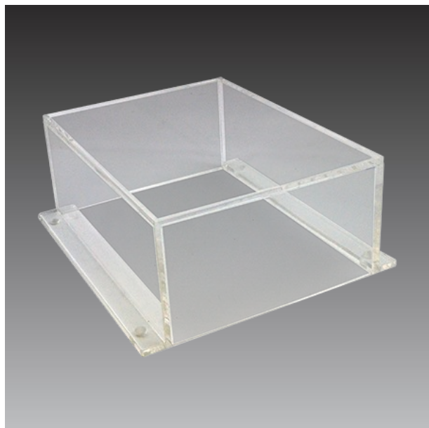
Acrylic Box (for R11C-30)