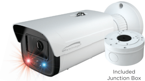
Included Junction Box