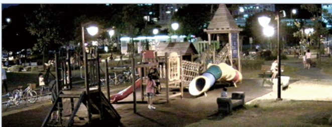
VIVOTEK SNV Camera - Show you true colors at night