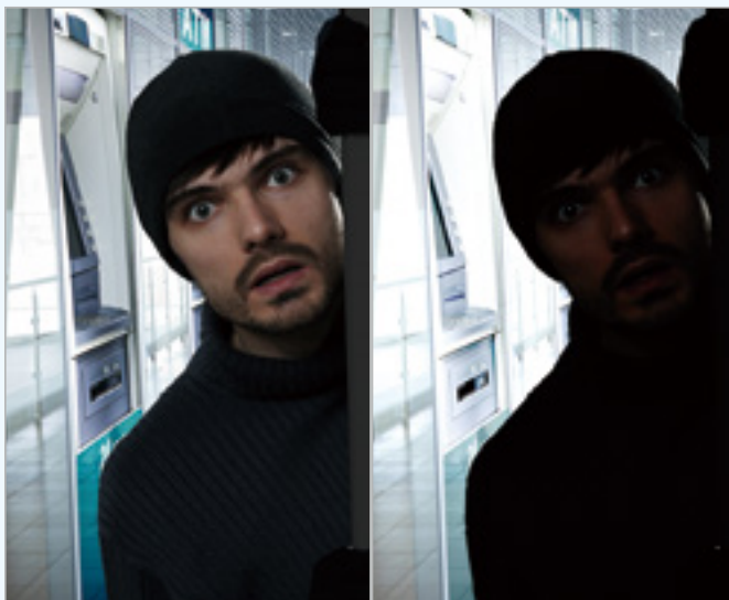
With WDR Pro